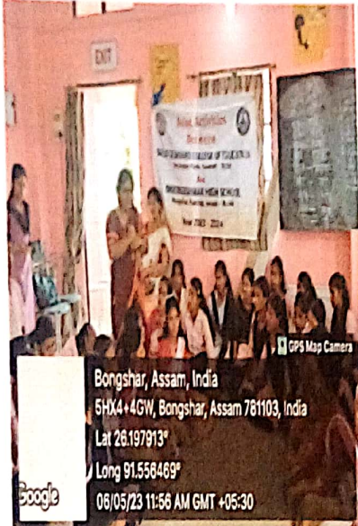
Bongshar, Assam, India 5HX4+4GW, Bongshar, Assam 781103, India Lat 26.197913° Long 91.558469° 06/05/23 11:56 AM GMT +05:30