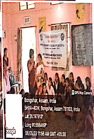
Bongshar, Assam, India 5HX4+4GW, Bongshar, Assam 781103, India Lat 26.197913° Long 91.558469° 06/05/23 11:56 AM GMT +05:30