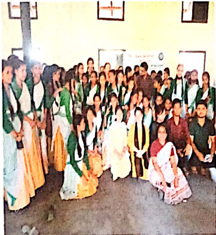
Guwahati, Assam, India BM34+92C, Salmie Garigaon Rd, Bezopara, Garigaon, Guwahati, Assam 781014, India Lat 26.153159° Long 91.855327° 06/05/23 11:28 AM GMT +05:30